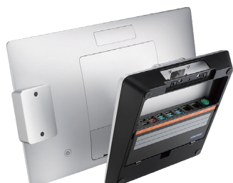
Connect hub to stand, supports separate operation