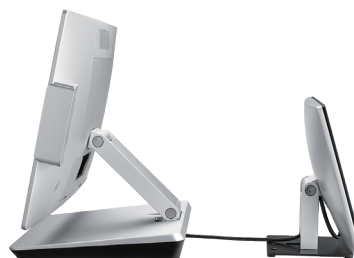
Integrate devices via USB-C