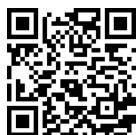
B360 Pro 3D demo