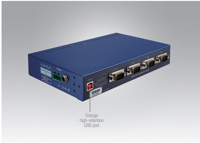
Orange high-retention USB port